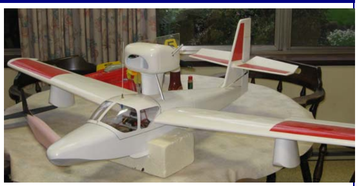
Ralph Suter's Flying Boat ( Above ) Jerry Holcomb's Japanese "Emily" ( Below )