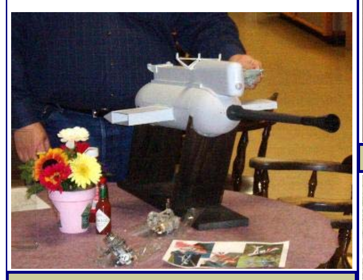
1/4 Quarter scale cannon that will be mounted on a Stuka

flying. It was determined that this practice could cause a pilot to become distracted and could cause an accident. RC car driving will not be done while flying is in progress. A discussion was also held about young chil-