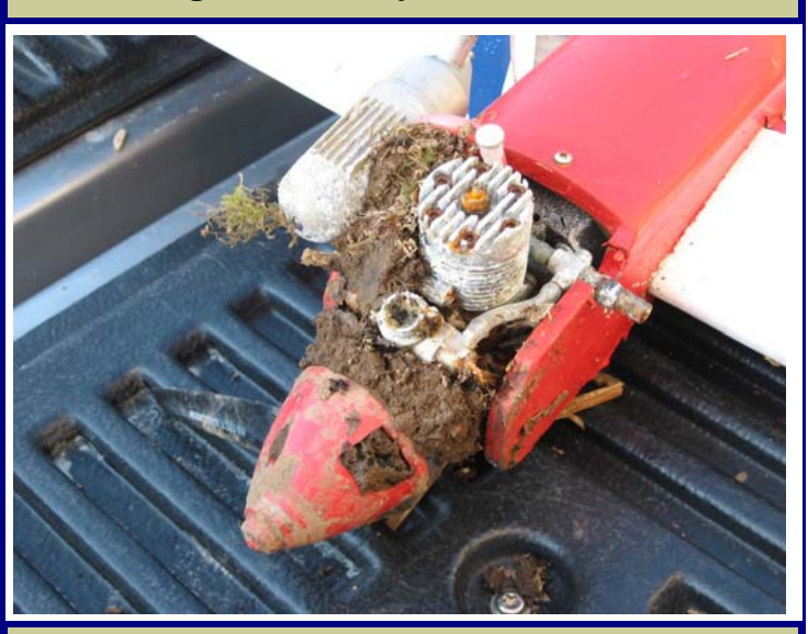
One engine after 6 months in the ground