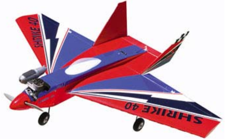
September Raffle: Lanier Shrike 40 ARF Won by Cliff Bemrose

Editors Note: the Treasurer called and reported the following information: