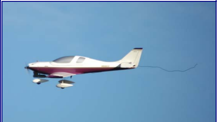
Alan Cooper's Lancair ES after taking out the electric motor and installing an OS 15 LA.

Please fly safely. It's much more enjoyable than the alternative.