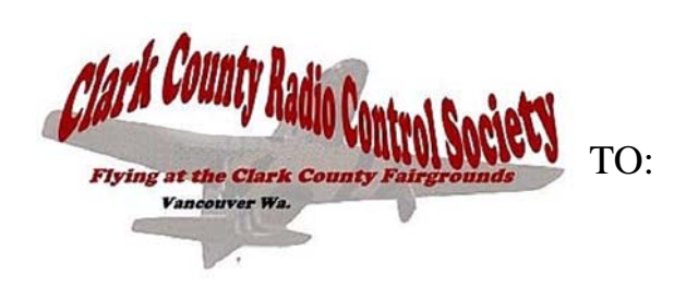
First Class Mail Address Correction Requested

The Clark Flyer P.O. Box 65566 Vancouver, WA 98665