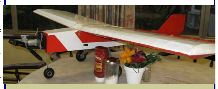
September's Raffle: Big Stik ARF

Meeting called to order at 7:30 by President vears holiday meeting. A motion was made and passed.