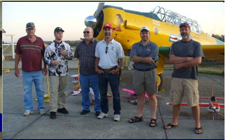
The gang at Pearson Airport