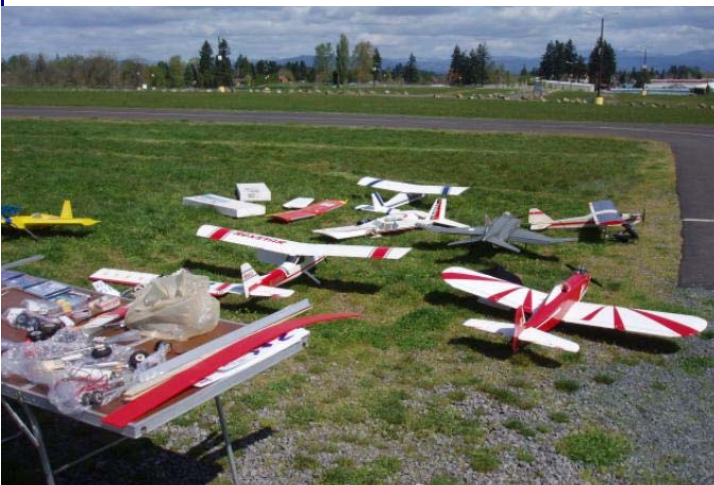
A lot of planes for sale or trade.