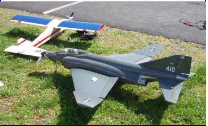
A Very Nice F-4 Phantom